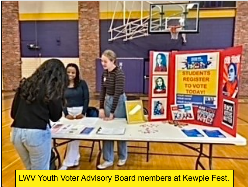
LWV Youth Voter Advisory Board members at Kewpie Fest.