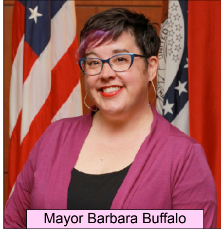
Mayor Barbara Buffalo