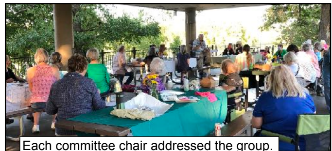
Each committee chair addressed the group.