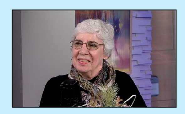
Continued on pg. 4

LWVMO Board - There will be a Making Democracy Work workshop in Columbia on Sept. 28 and a fall conference on November 2.